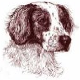
California Brittany Club