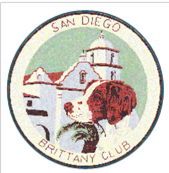
San Diego Brittany Club