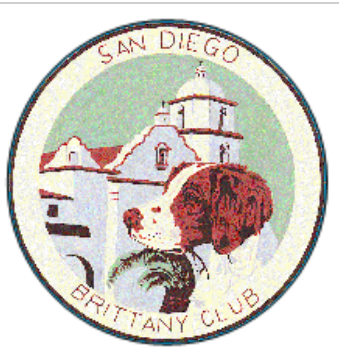
San Diego Brittany Club